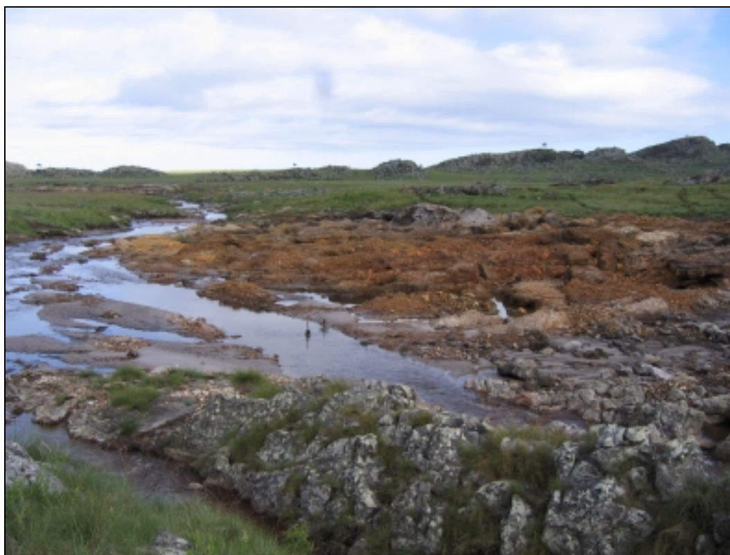
Photograph 1 – So-called mine “Camp Nr 1” at the springs of the Muvumodzi river