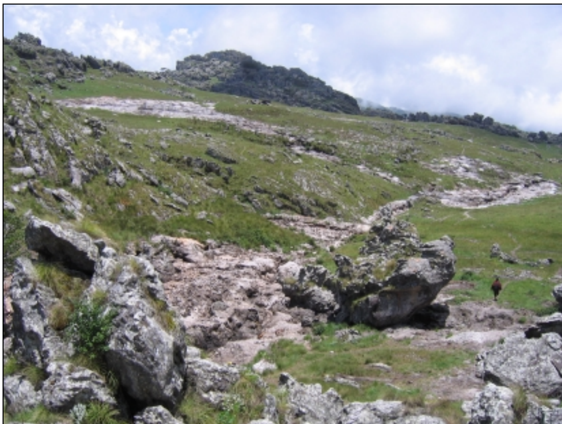
Photograph 3 – Complex of mines at “Musange”