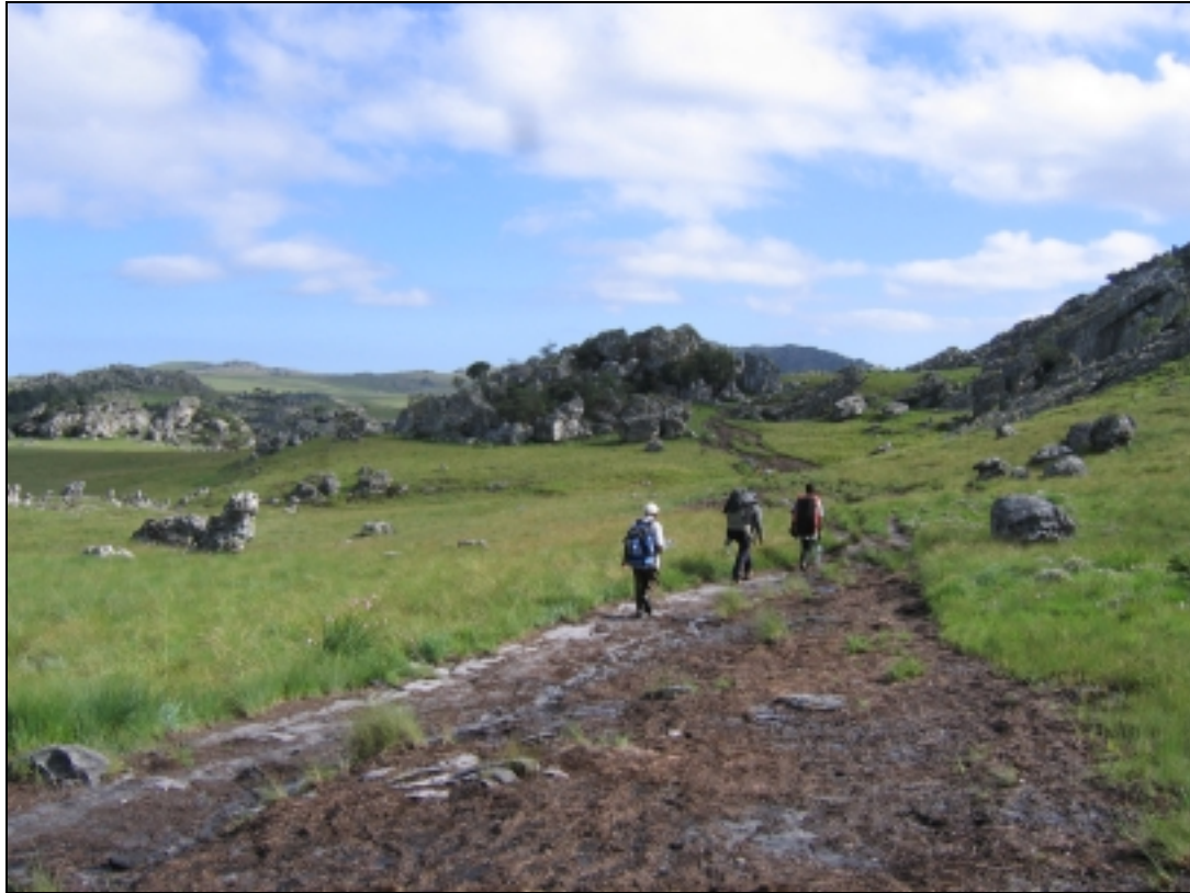
Photograph 5 – Wide footpaths interlinking the mining zones on the Chimanimani highlands