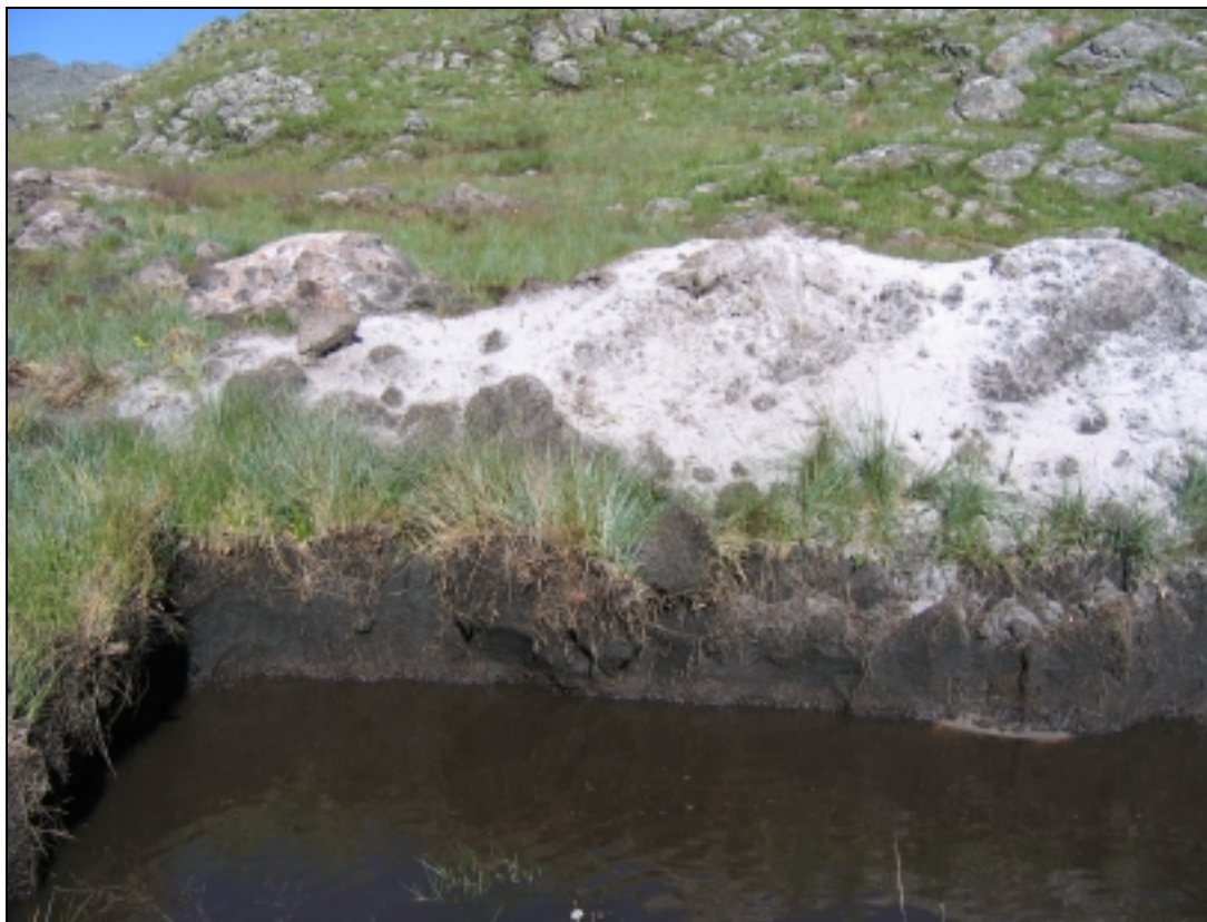
Photograph 6 – The soils where mining is done are mostly organic with a sandy subsoil.