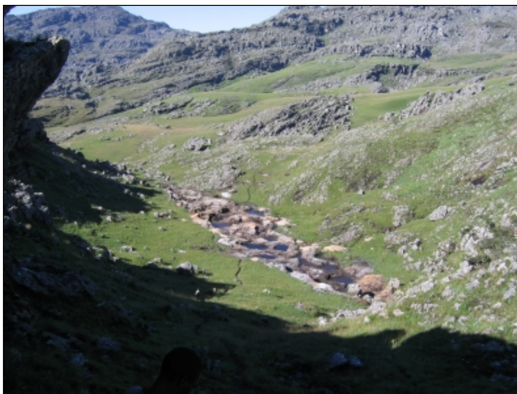
Photograph 2 – Mine hidden in a valley above Camp Nr 1