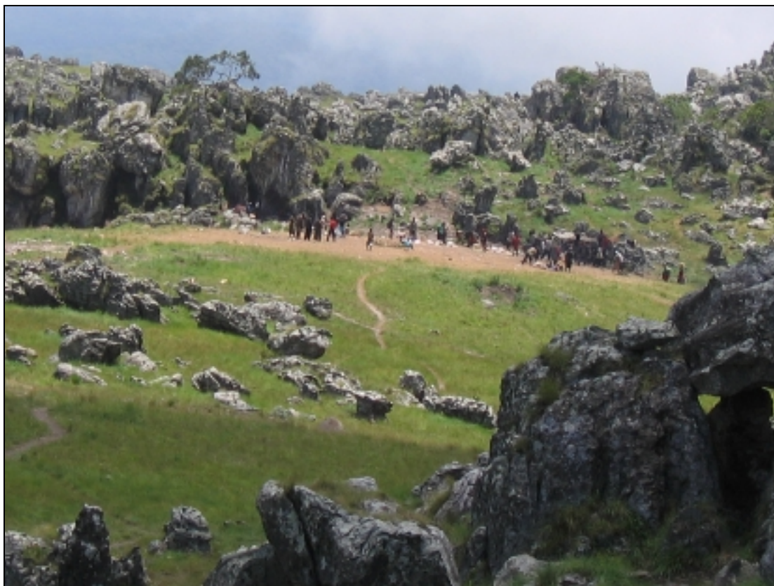
Photograph 4 – Market at Musange (so-called Camp Nr 6)