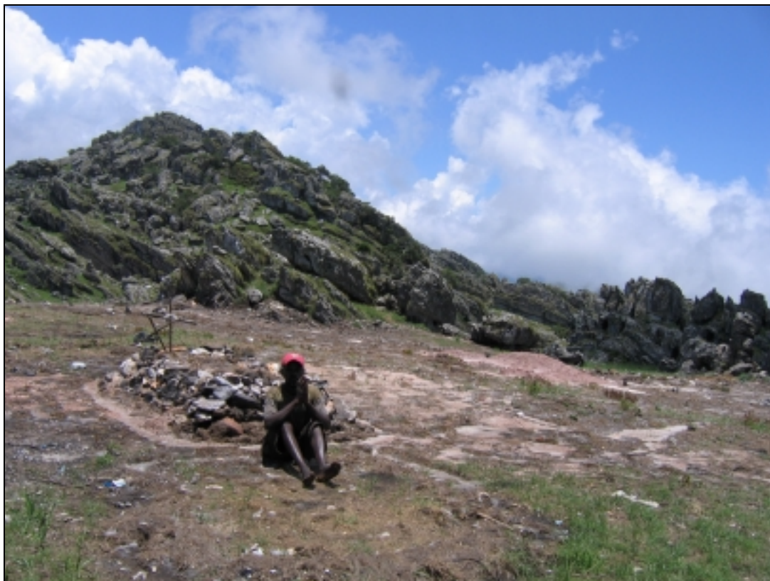
Photograph 8 – Grave of a miner allegedly killed by guards on the 21st November 2006 on the market of Musange