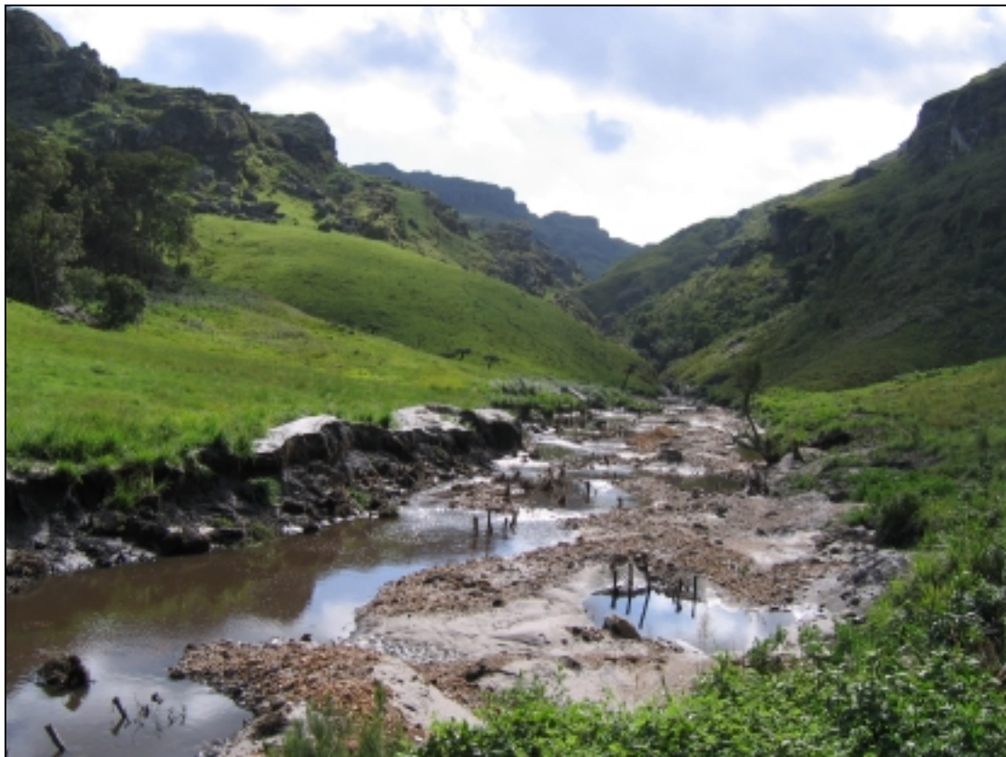
Mine at the so-called "Camp Nr 4"