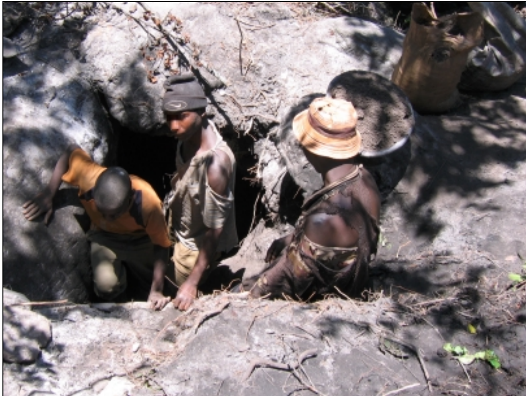
Photograph 7 – Mining in galleries in Musange zone